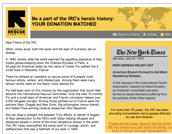
The IRC website does a good job of showcasing their history.